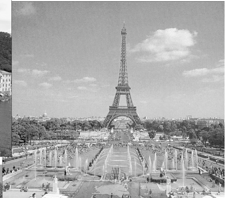
The Eiffel Tower in Paris – Capturing the imagination of the world.